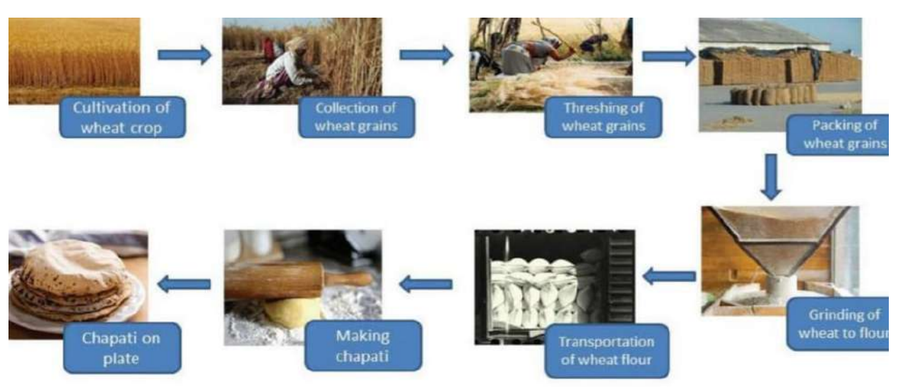
Fig. 13: Story of chapati: from farm to plate

Observe the Figure below and try to understand the different steps involved to get the wheat flour once seed grains germinate in the farm and make the chapati that we eat.